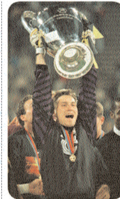
▲ Stefan Klos of German club Borussia Dortmund holds the Champions League trophy aloft in 1997.

The competition was revamped as the Champions League in 1992. Group stages were introduced, guaranteeing more games and vast sums of television money for the competing clubs. Champions League success is now essential for the financial health of Europe's top teams. A report in 2005 showed that taking part in the tournament can add 10-20 per cent to a club's total income in a season. Failure to qualify can be a financial disaster.