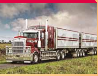
The powerful Kenworth T909 can pull trailers loaded with a variety of things, including grain, livestock, and mining material.